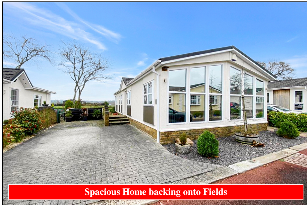
Spacious Home backing onto Fields

14 Bluebells Court, Organford Manor Country Park, Organford, Poole. BH16 6ES